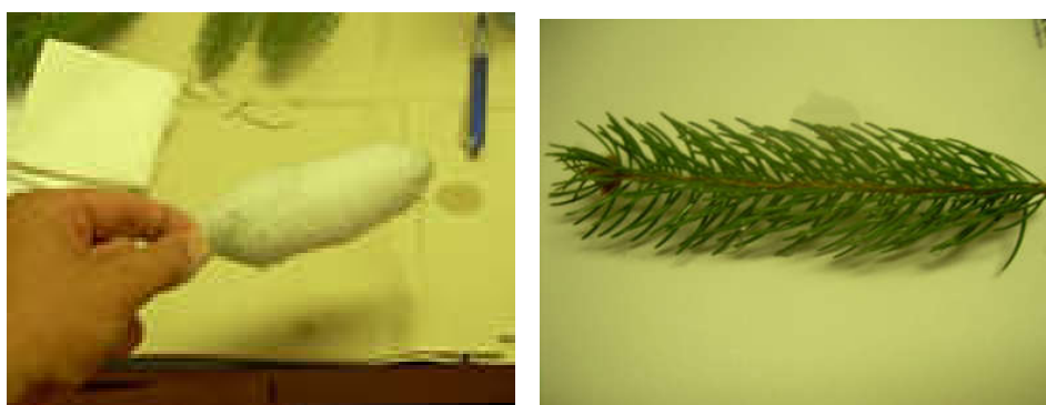
Figure 3 – Different treated samples – foam and water

The measurements clearly show that water and foam remain on the surface of the foliage in completely different shapes (Figure 3). Water is not evenly distributed, but it sticks to the surface in drops, separately, while the foam surrounds the twig in a homogenous mass. In spite of the conspicuous difference, we do not know if the difference in structure causes any significant difference in the extinguishers' ability to remain on the surface. If so, then the extinguisher which has more quantity on surface possesses more heat capacity proportionately.