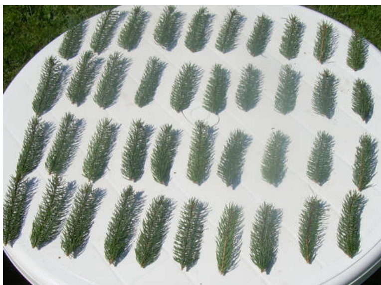
Figure 2 – Preparing the spruce twigs for measurement

Light Water, out of which foams of different expanditure were created, using a mixture of 3%. These were in three different bottles: Hk = 6; Hk = 9; Hk = 12.